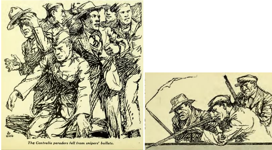
Figure 1. Centralia Parade. From Jerrold Owen, “Centralia: The Inevitable Clash Between Americanism and Anti-Americanism,” American Legion Weekly 1, no. 24 (December 12, 1919), 8-9.

This reference points to a few important details regarding how the Legion saw itself during these early days. Despite engaging in what can only be called vigilante violence, the Legion saw itself as the defender of “law and order” and repeated this claim time and again. In city after city the Legion took the law into its own hands, all the while proclaiming the fundamental legality of its actions. In this, the Legion secured for itself a place in the history of vigilantism in American history. Many so-called patriotic organizations have felt justified in taking the law into their own hands, in the name of the law, when the threats to the nation were seen as too grave to ignore or where confidence in the ability of traditional law enforcement was low. 48 The Legion saw as a crucial part