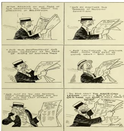
Figure 2. Grand and Glorious Feelin’. From American Legion Weekly 1, no. 1 (July 4, 1919), 11.

The Legion press was filled with incendiary articles about the red menace. Throughout the 1920s, the Legion published articles and studies about just how many radicals there were in the nation and what their aims were and asked what could be done about them. The answer, of course, came from the Legion itself. Legionnaires saw themselves as a bona fide good fighting the evil of Socialism. 57 In a famous cartoon in the first edition of the American Legion Weekly , a man sits reading a newspaper, his anxiety rising with each story about “the spreading of Bolshevism” and the “terrors of Russian Sovietism,” on top of reports of “starving Europe” and the “high cost of living.” His anguish is only assuaged when he reads about the American Legion and the “gr-r-rand and glour-r-rious feelin’” it invokes among the American people. 58