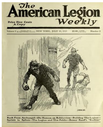
Figure 3. Enemy at the Gates. From American Legion Weekly 1, no. 2 (July 11, 1919).

The second issue of the magazine, the cover of which depicted a gallant Legionnaire sneaking up on a disheveled, foreign-looking man holding a bomb in front of a building labeled “American Institutions,” featured an article written by Ole Hanson, the mayor of Seattle who had become a folk hero for his role in beating back a general strike there. Hanson’s article described the horrors of Bolshevism and the devastation it was wreaking on Europe as well as what it had in store for an insufficiently vigilant America, before firmly declaring that there was no middle ground in the fight against it. Only through martial vigilance and a cooperative, conciliatory attitude between capital and labor could such horrors be averted. For Hanson, only by “fair, square dealing between the employer and the worker, Bolshevism is destroyed.” 59 Eventually, this attitude would come to characterize the ideology of the American Legion. But in its early days, the organization was less interested in a “fair, square deal” between capital and labor and more interested in preserving law and order against any perceived threat.